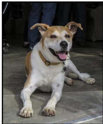
Jynx at Rockspire 11.4.17