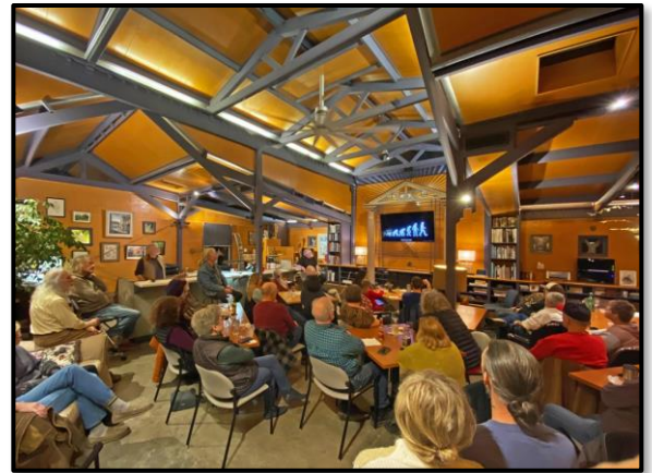
The February Rockspire Forum

In May, Opera in the Ozarks is scheduled to delight and inform attendees with musical selections chosen for their second annual performance at Rockspire. Other events in the works are family picnics, musical concerts, advisory meetings, makers classes, and community gardeners "hands-on" events. Rockspire's website has added an events calendar where future happenings are announced.