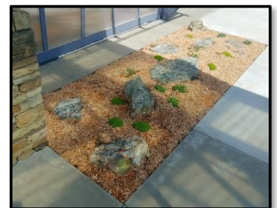
Newly planted Rock Garden at the MobbyMac Carriage House Photo by: G. Myers 3.29.23

The focus in the main vegetable gardens this year will be soil remediation using special plantings. Last fall we concentrated on improving the soil by adding organic chicken litter and mulch, allowing it to "cook" over the winter. This Spring we will be seeding most of the 6,000 square feet garden with a cover crop of Sorghum Sugar Grazer II Sudan Grass. In addition, we will be planting 200 square feet of the garden with perennial plants such as asparagus, artichokes, horseradish, and Jerusalem artichokes.