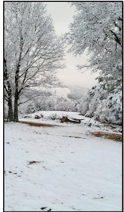
First snow of the season 11.15.22

CELEBRATING THANKSGIVING takes on special meaning this year as we opened our doors with more events after two years of semi-isolation due to the pandemic. This year’s events at Rockspire attracted newcomers as well as regulars. We’re grateful so many of you expressed a willingness to participate in more activities. We hope all of you have a safe, healthy, and enjoyable season to celebrate the good things in life. We look forward to seeing you in 2023.