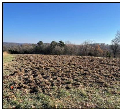
Soil reclamation area 11.12.22

Rockspire is an awesome opportunity to do just that as well as learn and teach with others. We highly recommend everyone get involved in one form or another."