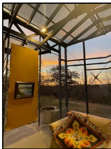
Sunrise on the Plein Air Painters of Eureka Springs Holiday Exhibit 11.6.22