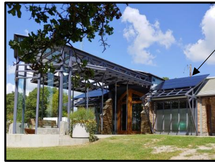
MobbyMac's East-side solar array generating 2,000 watts. Another array is mounted on the West-side of the canopy for a total of 4,000 watts generated. Both arrays face South.

THE SHOP COMPLEX EXPANSION , a 4,000 square feet addition to the existing 1,000 square feet of shop buildings is progressing quickly after waiting on the local concrete supplier's backlog due to the extreme summer heat and lack of drivers. The structure shown under construction in the photos below represents only half of the building. The other half, which is taller, will have a mezzanine level that will be used for smaller projects such as stain glass or wood turning on a lathe.