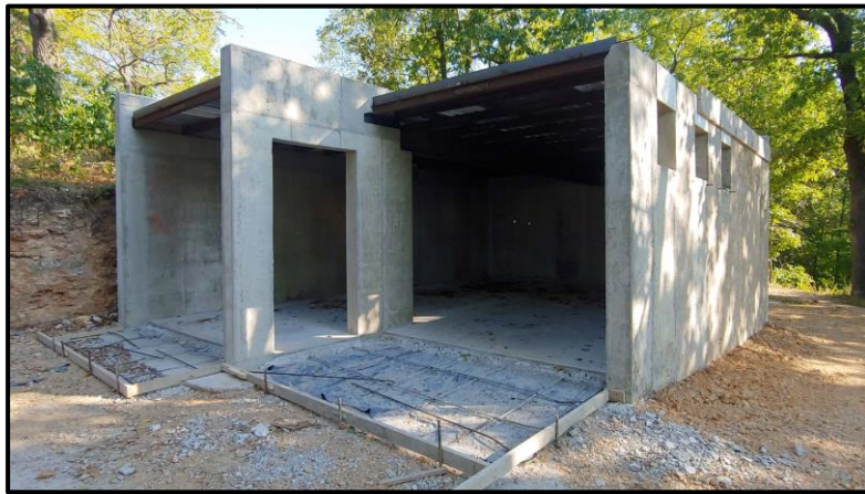
Johnson's Garage Structure at Rockspire Homesites Photo by G. Myers 10.12.21

THE FIRST HOMESITES STRUCTURE is a concrete and steel building that will eventually become a two-car garage for the Johnson's home, but for now will serve as the homesite construction office and shop. This means we can base close to the site, and not at the main Rockspire shop which is 1/2 mile away. The roof of this structure will also double as an observation deck, allowing for construction observation with a clear view of the homes on the downslope.