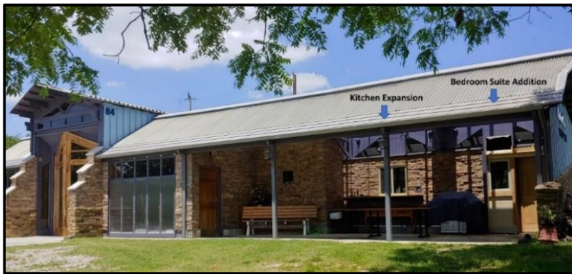
Modifications to the MobbyMac Carriage House