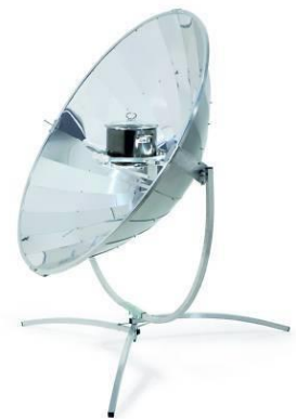
Parabolic Solar Cooker

ONCE THE CURRENT CARRIAGE HOUSE EXPANSION IS COMPLETE , we plan to wrap up the construction projects at the MobbyMac Carriage House by adding a drive-under canopy at the main entrance, a bocce ball / horseshoe court, and an outdoor solar patio and kitchen. The solar patio will feature a photovoltaic panel array to power the Carriage House and solar cooking devices in the outdoor kitchen such as the solar cooker pictured above.