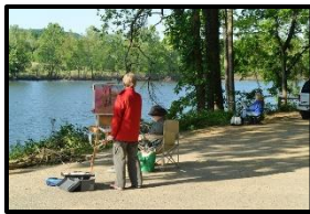
PAPES members doing what they love to do ... painting 'en plein air' around the Eureka Springs area.