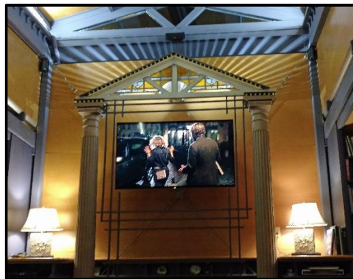
Movies at the MobbyMac on the new Sony 4K-HDR, Ultra-HD Television