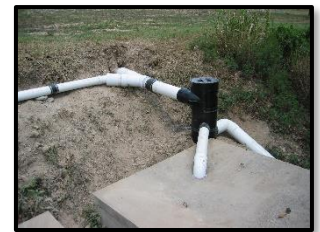
Centrifugal rainwater pre-filter piped to cisterns near the MobbyMac Carriage House.

The first phase of the water management system was installed several years ago as a rainwater collection system, and is supplying potable water to Betty's Birdhouse Cabin and the MobbyMac Carriage House. The next, more sophisticated phase will be implemented when the first group of homes are built in the next few years. When this phase is complete we hope to feature all aspects of the water management system including micro-hydro electrical generation, crop irrigation, and the latest generation hybrid aerobic septic systems.