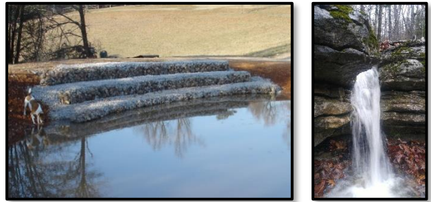
Ponds, streams - waterfalls, and cisterns are all part of the rainwater management systems being implemented at Rockspire.

We recognize that water management represents one of the major components of a truly sustainable ecosystem at Rockspire. Therefore, we are developing a totally integrated water management system that utilizes gravity, wind, solar, rain, springs, ponds, and well-water as represented in the Water Management Flow Chart below.