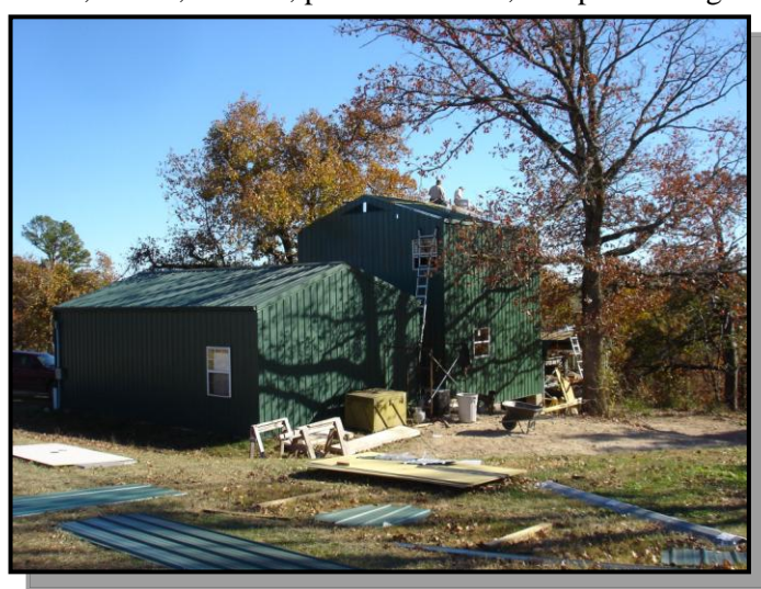
Woodworking shop and Shop Addition under construction Rusty Rothgeb and Bob Sanders - on roof of addition

THE NEAR FUTURE?" We've master-planned Rockspire as a place where enjoyment of nature and the arts is key to building a sustainable lifestyle. First planned and built were the underpinnings of that community. We needed a base camp while working and enjoying the natural beauty, so we have completed a Guesthouse ("Betty's Birdhouse"), a Drying Shed (for drying and storing harvested hardwoods for future projects), a Woodworking Shop, and we are almost finished with the MobbyMac Carriage House which will house an office, studio, kitchen, public restroom, and performing arts venue.