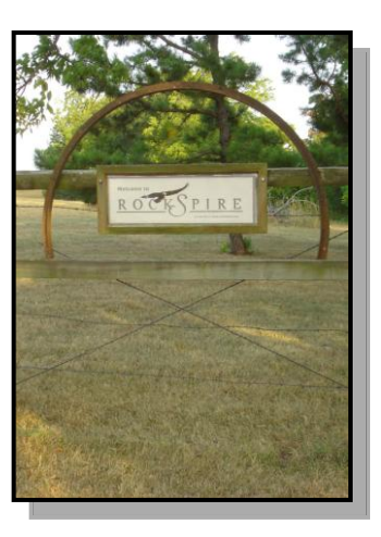
Welcome sign at the Front Gates 7.14.11

Our neighbors at Trigger Gap stop by frequently to check on progress as we have an "open gate" policy. Eventually, we hope to link both culturally and economically to the " micropolitan " of Eureka Springs -- a small town with many of the same cultural and job opportunities as a large urban center but without the congestion, pollution, and inherent problems of densely populated areas.