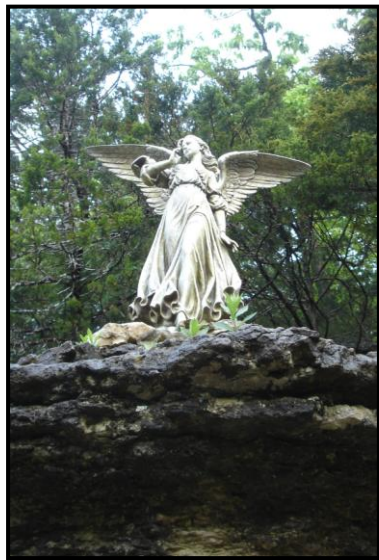
L'Inspirateur Angélique Photo by: G. Myers 5.10.13