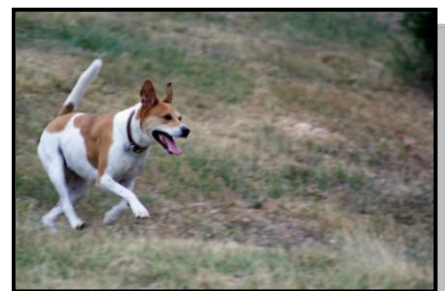
Jynx running in the west pasture at Rockspire 5.19.12