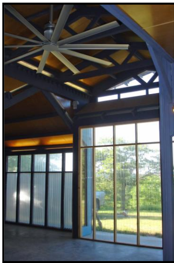
MobbyMac Carriage House Interiors Photos by G. Myers 5.22.12