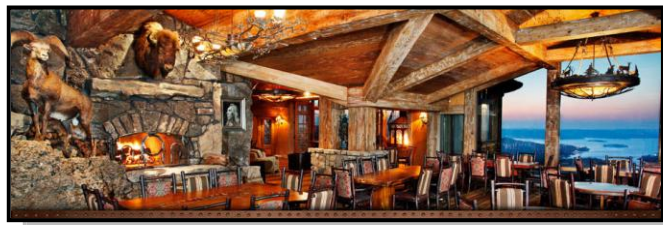
Top photos - Lost Canyon Cave; George Myers, Pam & Mike Johnson outside Lost Canyon Cave Bottom photo - Interior of Osage Restaurant at the Top of the Rock

T OP OF THE ROCK at Big Cedar Lodge is just 45 minutes from Rockspire and is a must see destination for your next visit to the area.