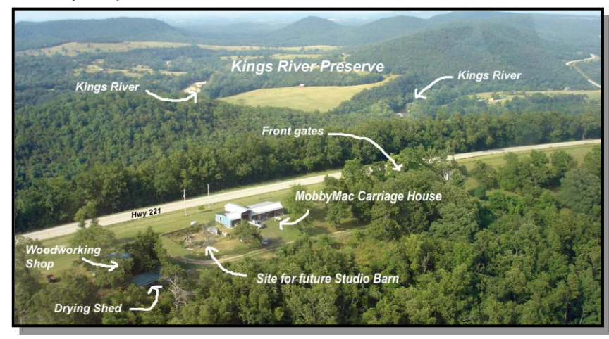
Aerials of Rockspire's western edge Looking Southeast (above), looking North (below) Photos by G. Myers 6.12.10

We are also planning a one-woman art show this October of sketches and paintings by MobbyMac herself! Who is MobbyMac you ask? Well, come and find out!