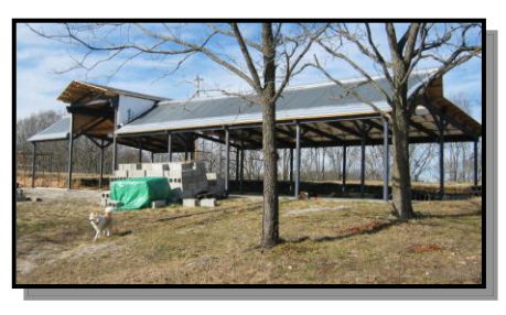
MobbyMac Carriage House progress Photo by G. Myers 1.29.06

MobbyMac Carriage House progress Photo by G. Myers 3.24.11