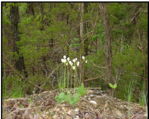
Wildflowers at cliff's edge