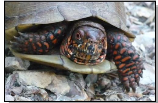
Eastern Box Turtle on the Upper Nature Trail