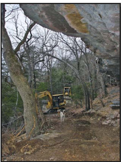
BREAKING GROUND ON THE UPPER NATURE TRAIL 11.28.09

O UR FIRST NEWSLETTER takes you on a journey deep into the woods of Northwest Arkansas. Nestled between the upper and lower bluffs that span east to west at Rockspire, a new section of the nature trail has been opened to show the beauty of 30-foot cantilevered rock cliffs overhanging narrow paths of pine needles and good ole' black dirt. The trail closes the loop from Betty's Birdhouse Cabin, on the west, to Camp Sassafras, on the east. The entire loop is 2 miles.